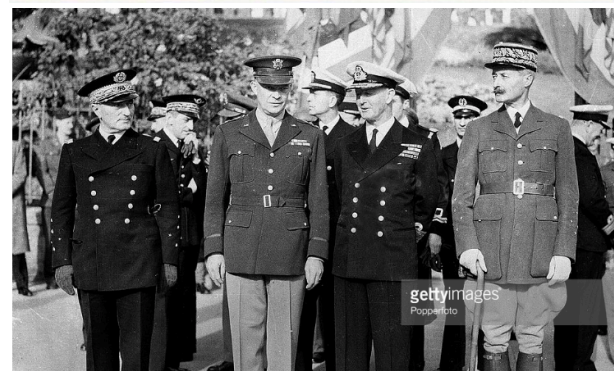
Adm. Darlan, LTG Eisenhower, Adm. Andrew Cunningham, RN, Gen. Henri Giraud at march past in honor of fallen allied soldiers, Dec. 42.